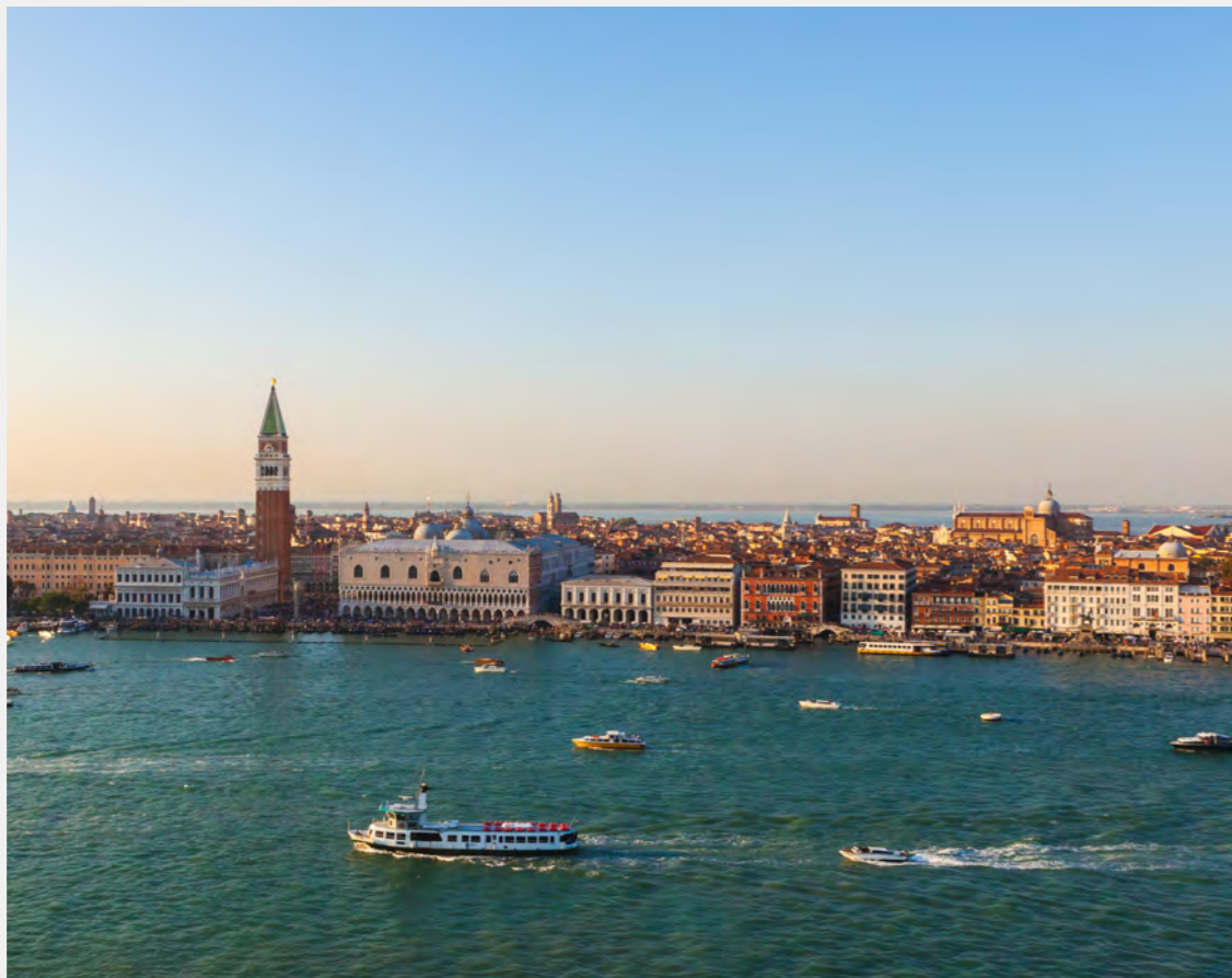
Venice