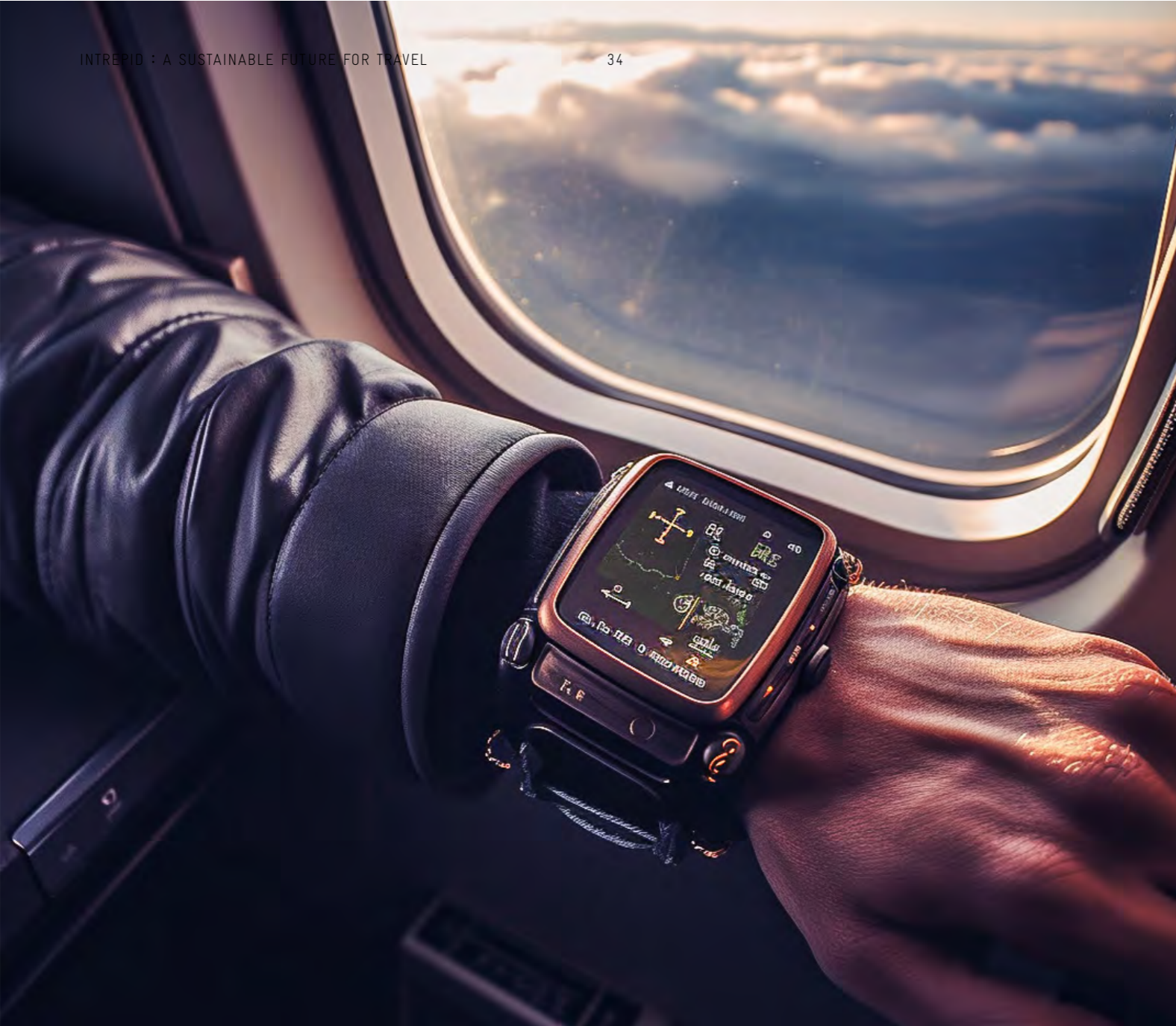
Real-time Footprints, AI imagery by Intrepid Travel