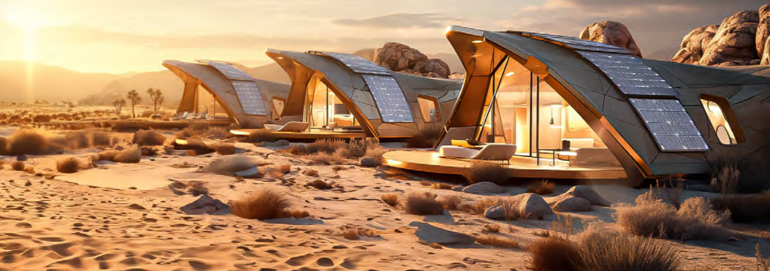
Ephemeral Escapes, AI imagery by Intrepid Travel