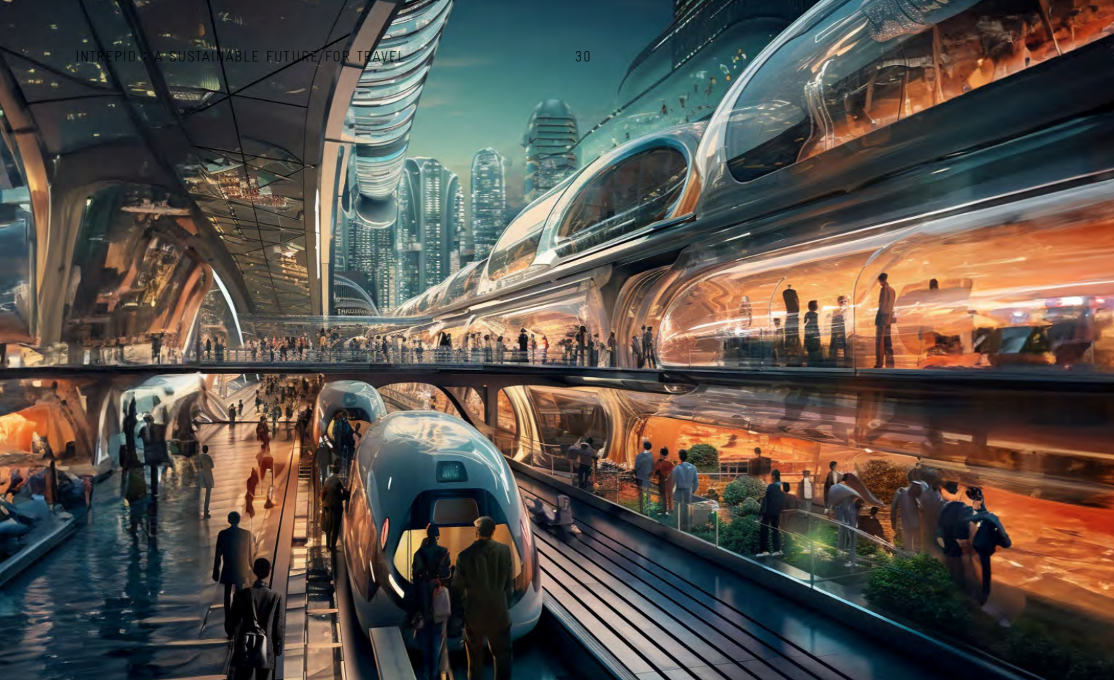
Enhanced Eco-mobility, AI imagery by Intrepid Travel